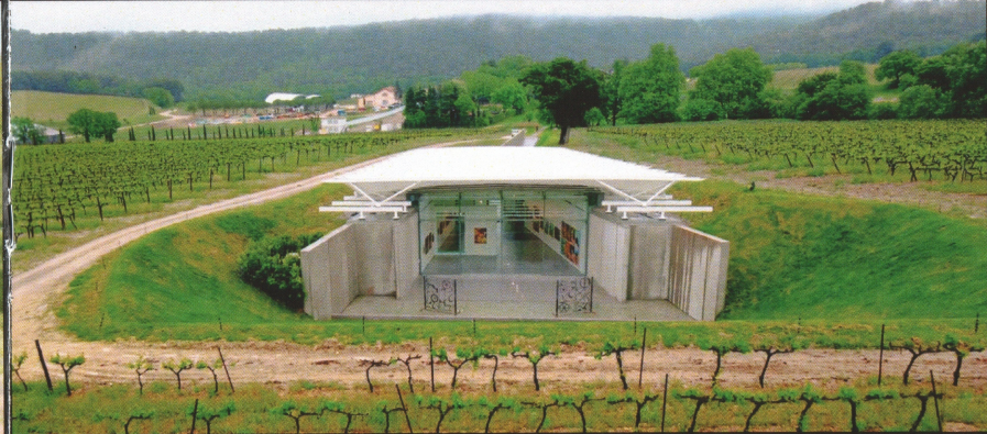
Exhibitions: Bob Dylan · Drawn Blank in Provence 9 May – 9 Nov. 2022 · Château La Coste, Provence, France